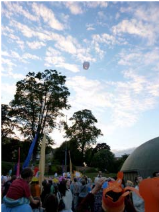
Great Malvern, UK: The now-famous Subud Britain opening ceremonies hot-air balloons-release!