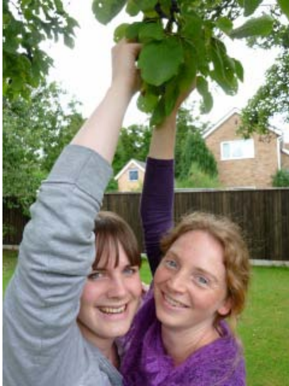
Great Malvern, UK: Reaching for the sky... two dynamic Subud youth leaders...during Zone 3 gathering in Great Malvern;