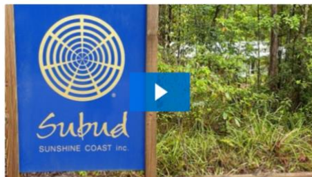
The Sunshine Coast Group