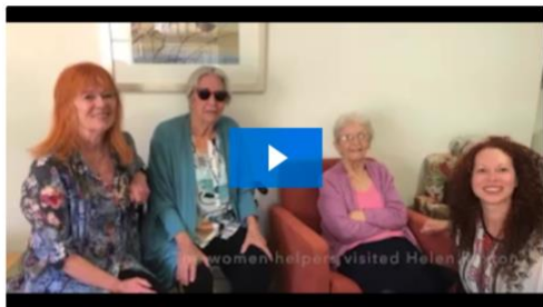
The Adelaide Group