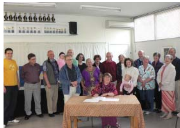
Thanks in part to funds received from the Parker Fund, a 99-year lease has been signed to secure a site in Canberra for the establishment of the Australian National Subud Centre. The signing ceremony is pictured above.