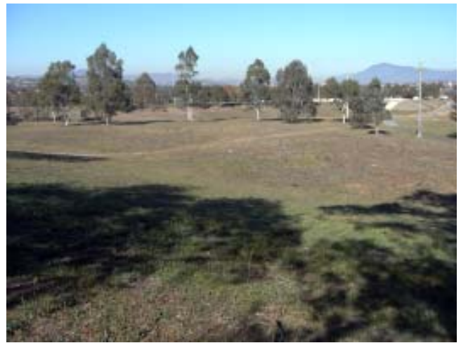
Site of the proposed Subud National Centre in Canberra, Australia