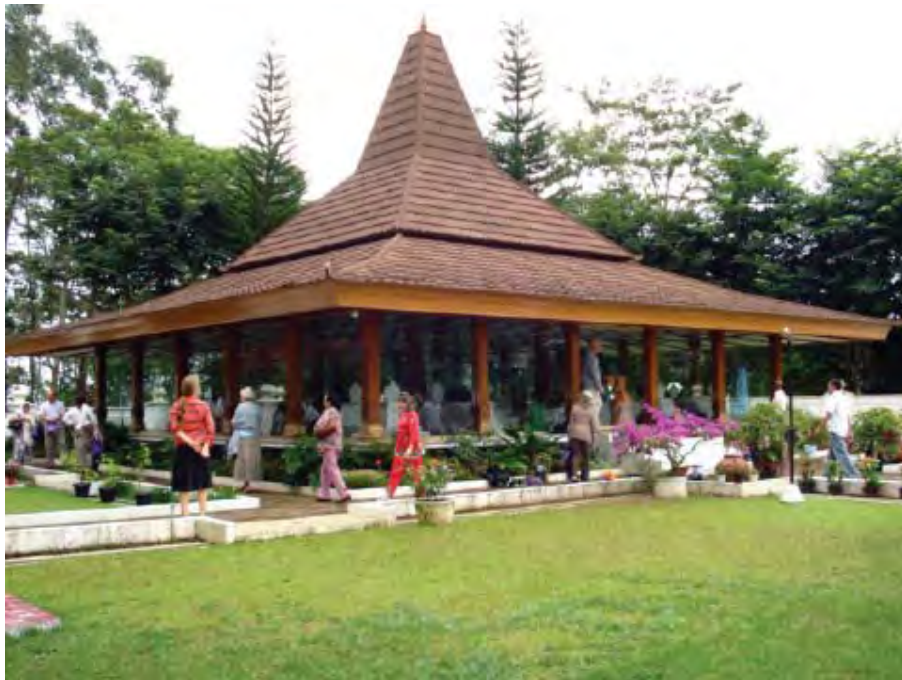
Cover photo & above: Subud members paying their respects at Bapak's gravesite, Suka Mulya, Indonesia.